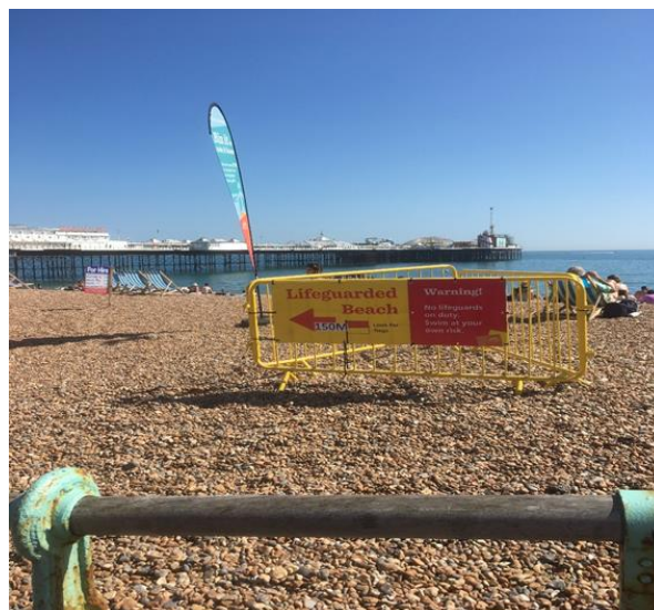
Example directional sign on the beachfront